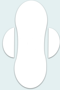
Pads (or Sanitary Pads or Napkins)

When you have your period, you will need to use something to soak up the menstrual blood. There are lots of different products to choose from. Ask for help about a product if you are unsure if it is for you. A nurse, family member or friend can help you decide.